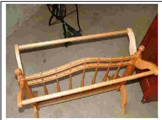
Cherry Quilt rack by Tom Elledge