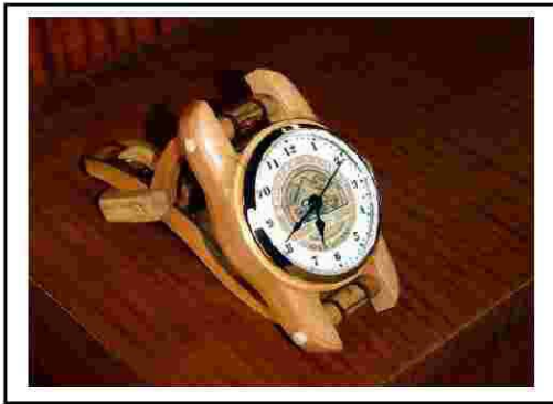
Watch by Tom Elledge