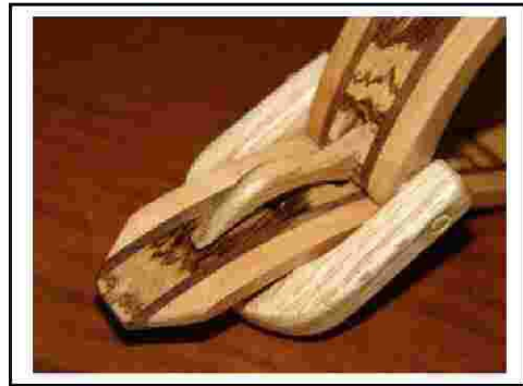
Detail of watchband