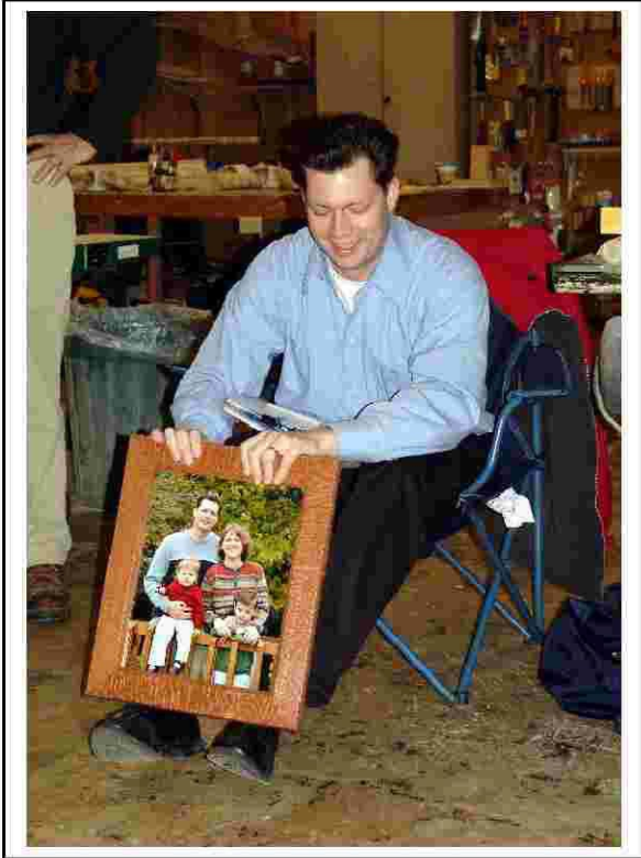
Leopard wood picture frame by Allen Brittell