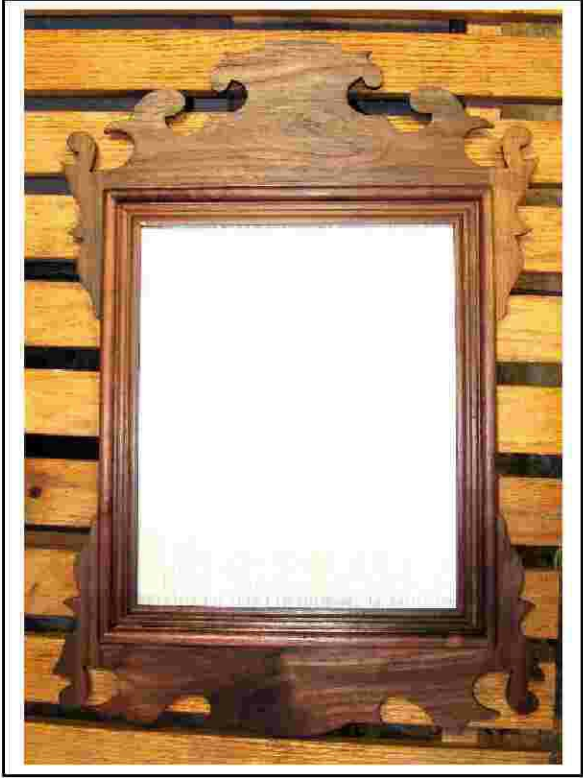
Walnut Mirror by Tom Elledge