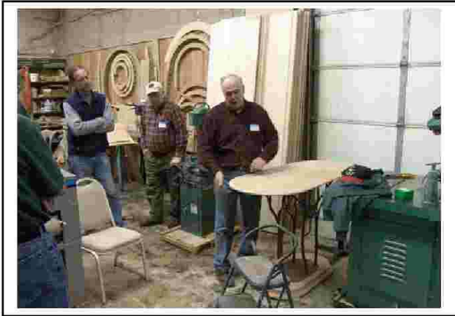
Church Alter