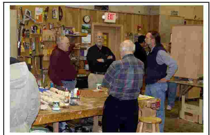
A few members discussing woodworking (I think).