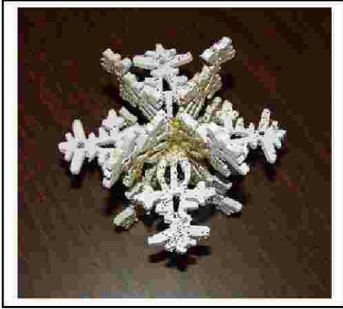
Snowflake made from 5-ply 1/8-inch plywood by Andy Obin.