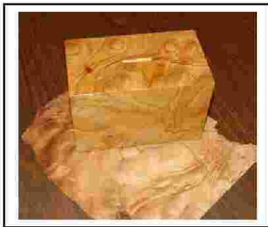
Maple cluster veneer bank and grease boxes (below)