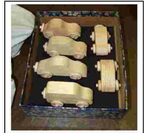
Toys for the kids

EDITORS NOTE: I missed the Show & Tell portion of the meeting last month so if the person that made these would let me know I will post them again next month.