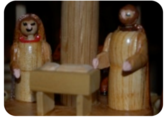
In October Palmer Burke shared his latest creations. These nativity carousels are lovely and are perfect for the holidays.