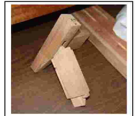
Detail work on chest