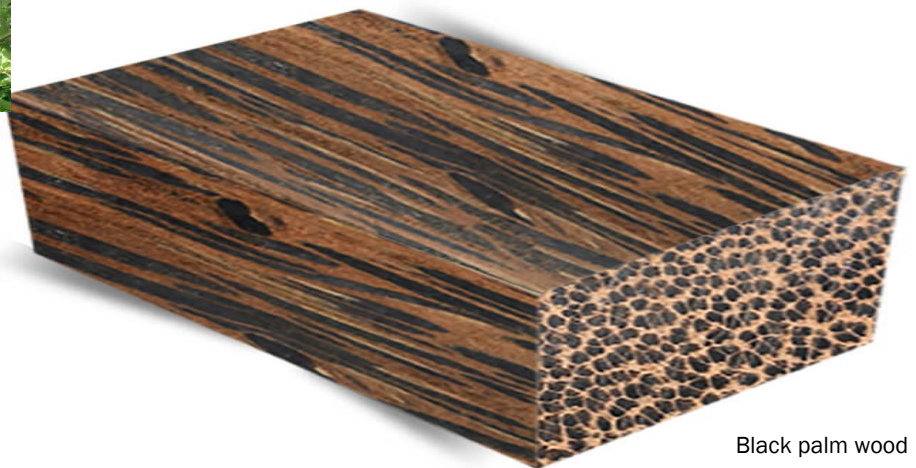
Black palm wood

Wood trivia: Black Palm is technically a grass, neither softwood or hardwood. Unlike other woods, the most usable part is toward the exterior of the trunk. It doesn't show any growth rings and has no knots. Some refer to this wood as porcupine wood.