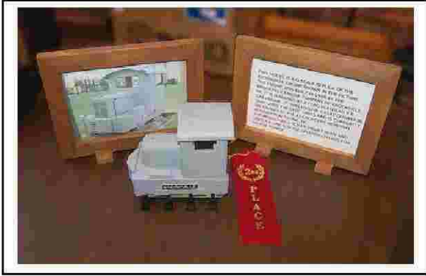
This model train was built to scale (1 inch to a foot) by Jerry Allison. This engine is still being built in Brookeville PA. This model runs.